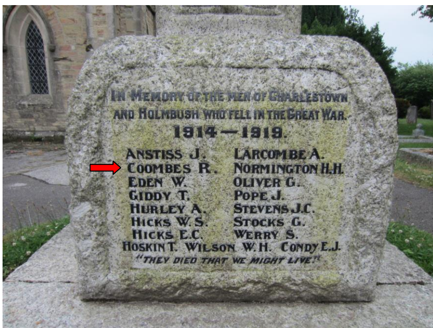
Charlestown and Holmbush War Memorial