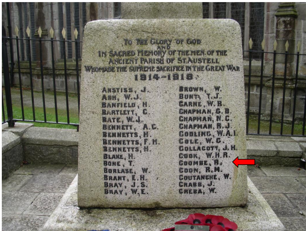
St. Austell War Memorial